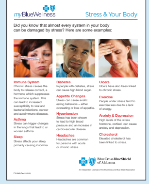
Stress & Your Body: FYH-240